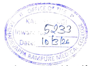
Statement showing the all Departments wise Statistical information Pertaining to Basaveshwar Teaching & General Hospital, & Sanagameshwar Hospital, Kalaburagi for the Month of Feb-2026